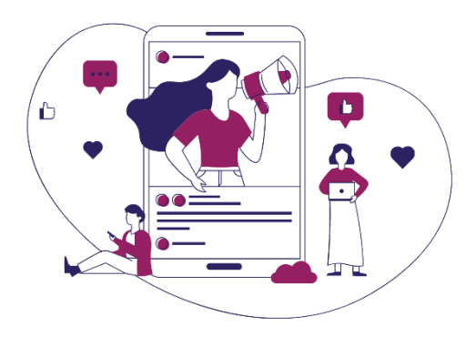
Your online first impression needs to be aligned with whom you are and whom you want to be noted on the labour market.

For such reasons, PBRAND4ALL has the purpose of creating an online and open-access tool for those who wish to develop their personal brand, by encouraging the training of their personal competences called the "Genie". This result will be presented as a visually attractive and easy to understand solution for those who want to keep improving and make a difference.