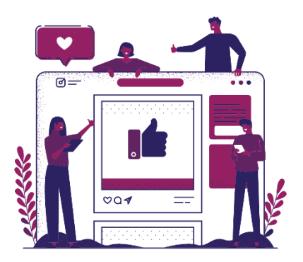
Increase your visibility in the digital world by strengthening your personal brand with the "Genie" tool.